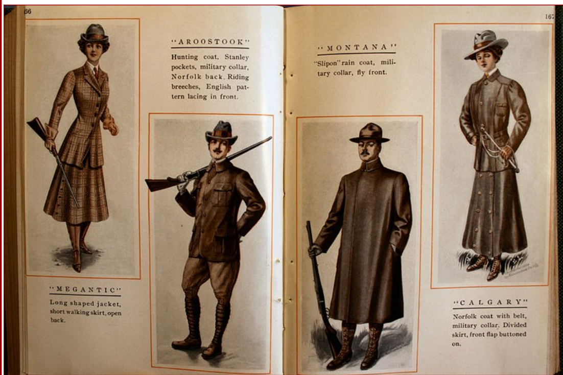
Men's and women's apparel advertised in Abercrombie & Fitch's initial (1909) catalog.

When a man named David Abercrombie opened a new excursions store, Abercrombie Co., in 1892, Fitch became the store's "most devoted customer." By 1900, Abercrombie's store had become very successful, and Fitch bought a major share in it, becoming